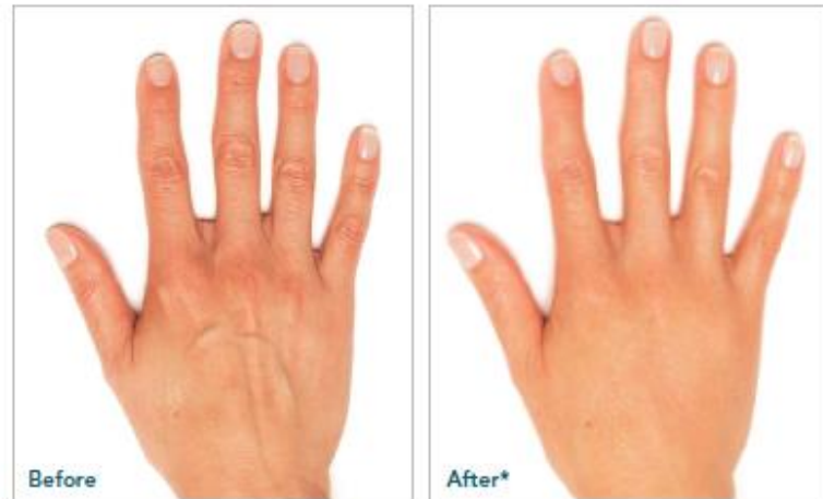
Andrea / 42

Treatment volume: 1 syringe (1.5 cc) per hand.