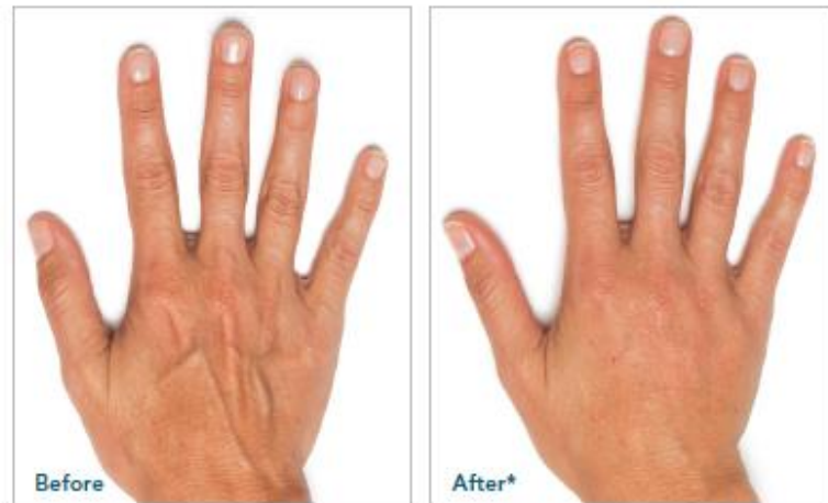
LeAnne / 47

Treatment volume: 1 syringe (1.5 cc) per hand.