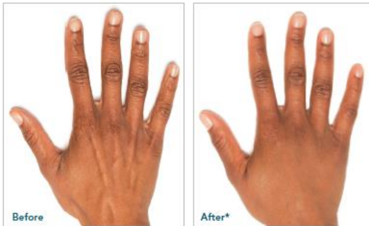
Zondra / 46

Treatment volume: 1 syringe (1.5 cc) per hand.